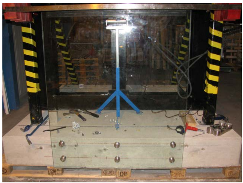
General overview of the complete system

Glass Clamp System: Glass adapter MOD 0747 rev. 1 Date: 09.10.2012